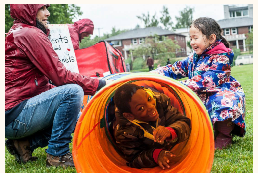
Tents & Tunnels: crawl through tunnels