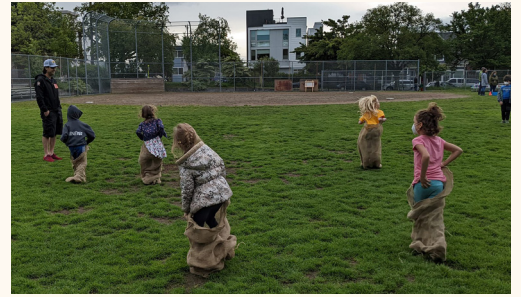
Potato Sack Race: see who can hop the fastest while their legs are in a bag