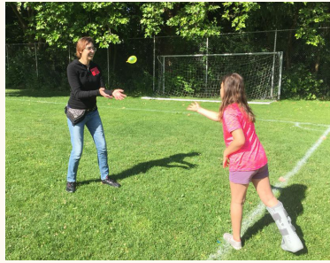
Water Balloon Toss: toss the water balloons without breaking them