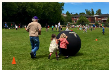
Giant Ball: move it as a team