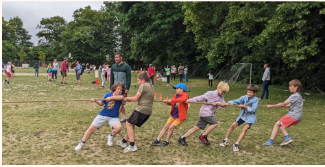
Tug-O-War: two teams on either end of a rope try to pull the rope towards their side