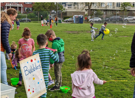
Bubbles: make bubbles