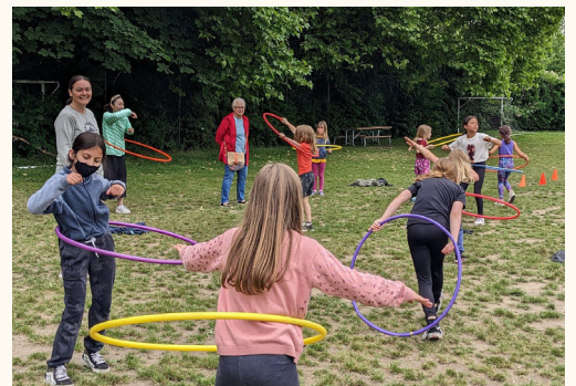
Hula Hoops: how long can you hoop?