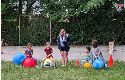
Ball Bounce: bounce along on a big ball